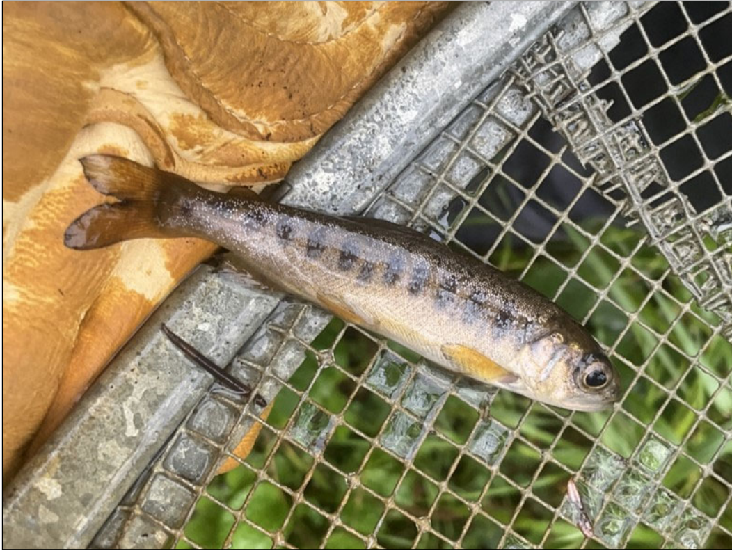
Figure 1.—Juvenile coho salmon captured at waypoint 1620.