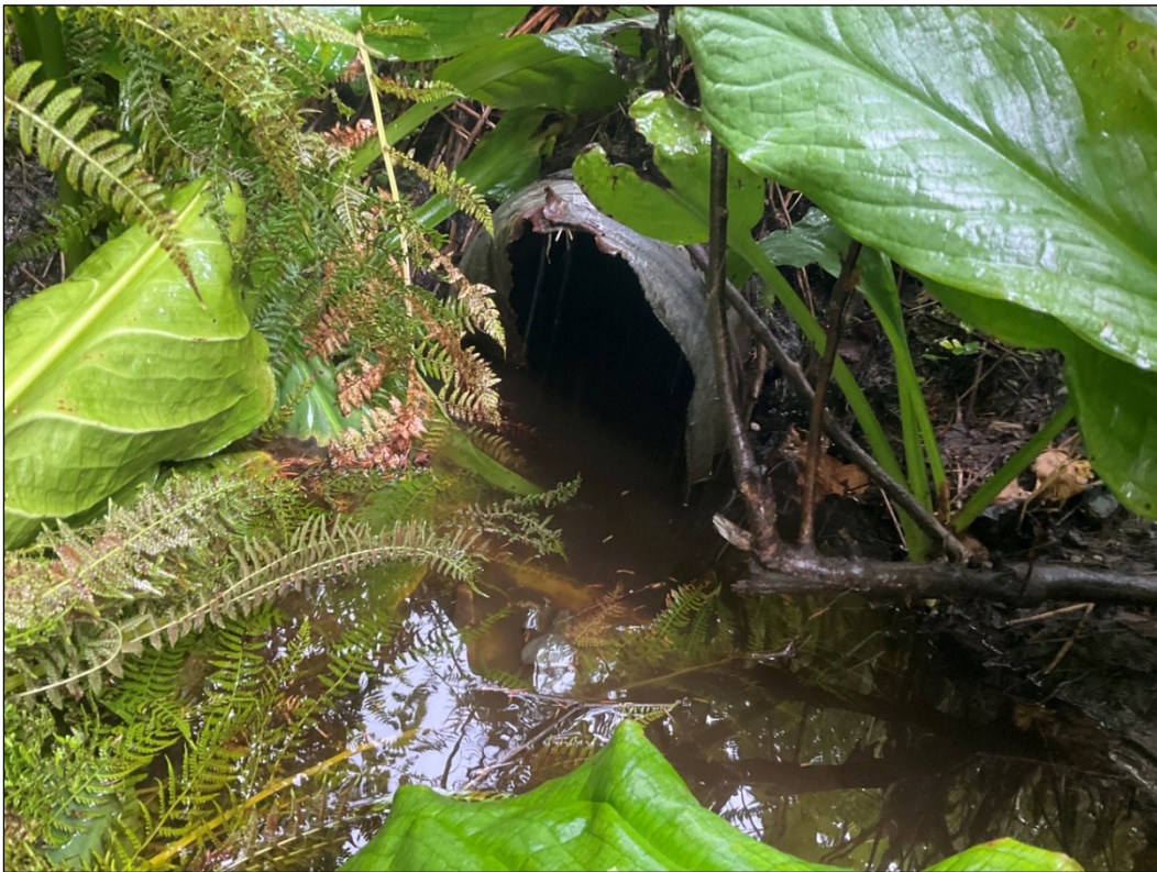
Figure 2.—Partially crushed culvert outlet at waypoint 1653.